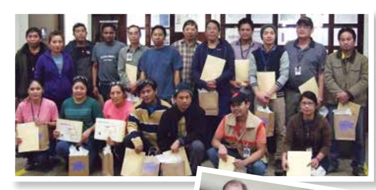
Graduates from Greater Waukesha Literacy's workplace literacy program with Dickten Masch Plastics

In addition to Wisconsin Literacy initiatives, member agencies also work directly with employers to provide company-specific instruction.