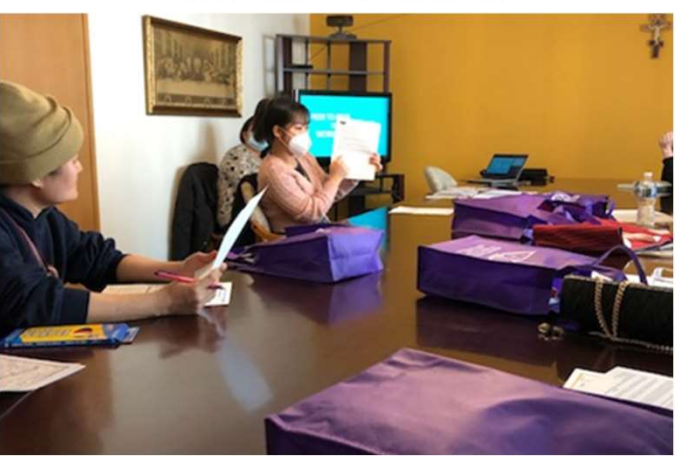
Milwaukee Consortium for Hmong Health <a href="https://mkehmonghealth.org/">https://mkehmonghealth.org/</a>